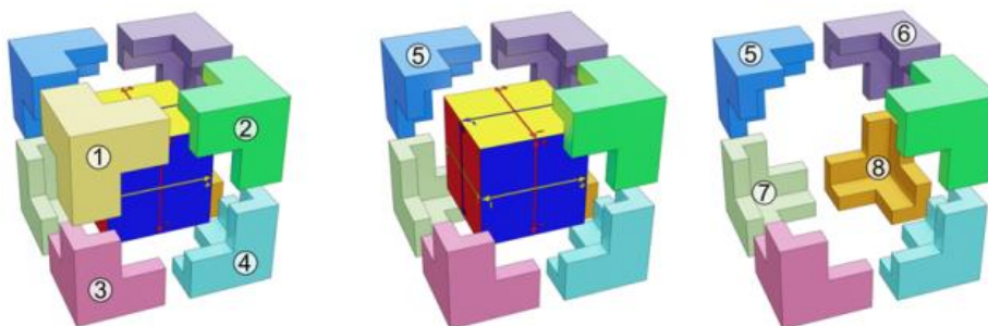
Figure 1. Out-of-Office Model