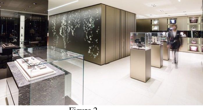
Figure 2 Proposed Foot Locker Stand-Alone Jewelry Store

customers can see all the jewelry options provided by Foot store including responses to any of the products discussed in Locker and what footwear and clothing match the collection. the reviews. Customer reviews will also be available both online and in-