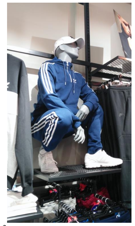
Figure 3 Proposed Foot Locker Mannequin Displays Wearing Clothing & Jewelry