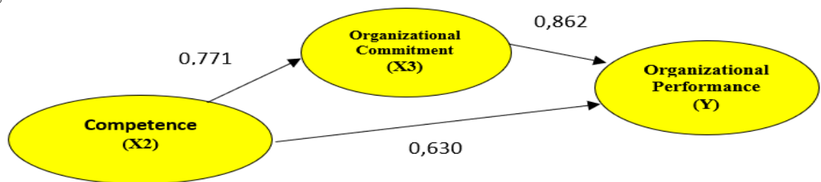
Figure 2. Pathway analysis of the influence of X2 on Y through X3

Based on the partial path analysis above, it can be described as follows. The analysis is an analysis of the pathway with the image of the sub-structure as follows.